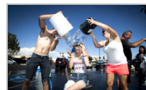
Photos: Ice Bucket Challenge at T.C.