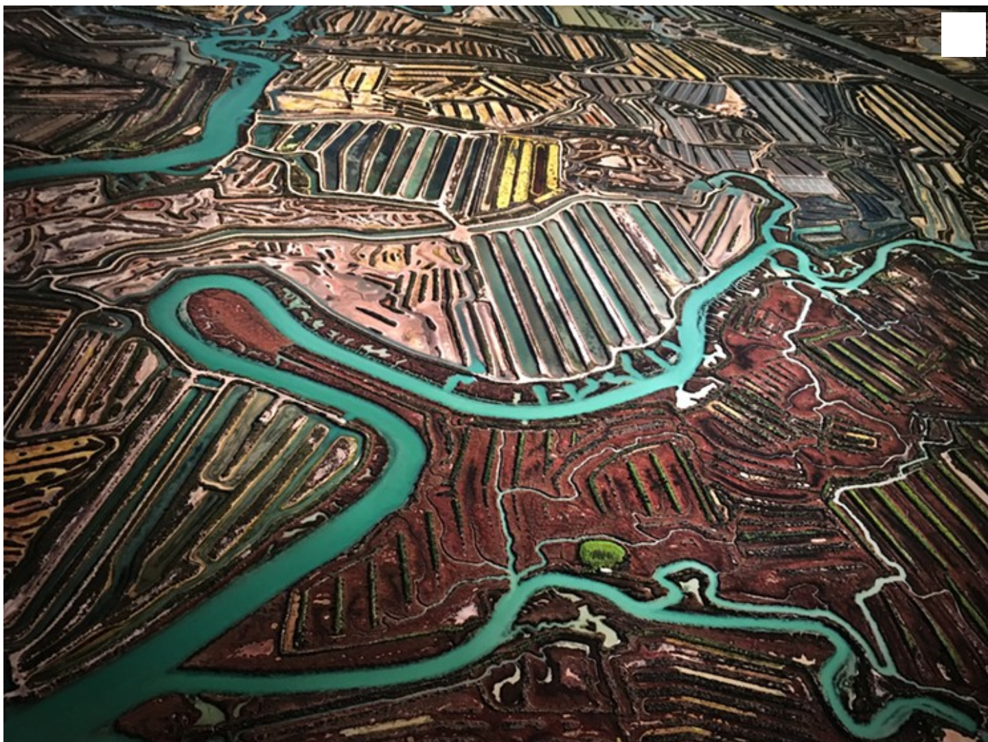
Detail of Edward Burtynsky photograph featured in "Water" at Phoenix Art Museum.