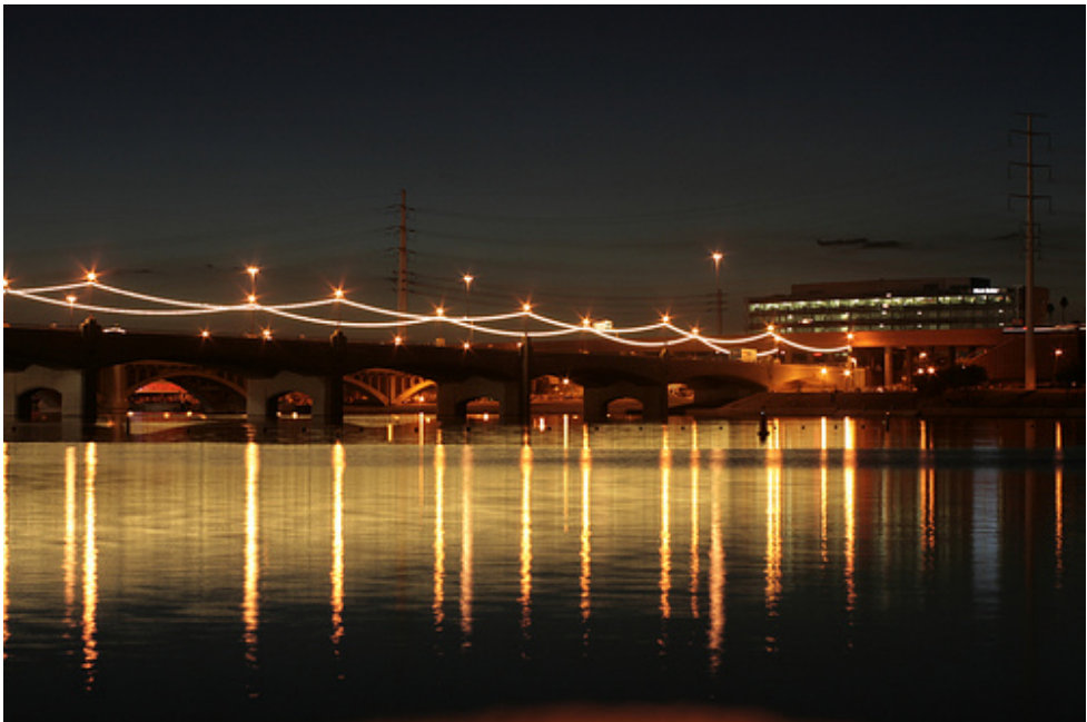
Mill Ave. Bridge in Tempe, AZ.