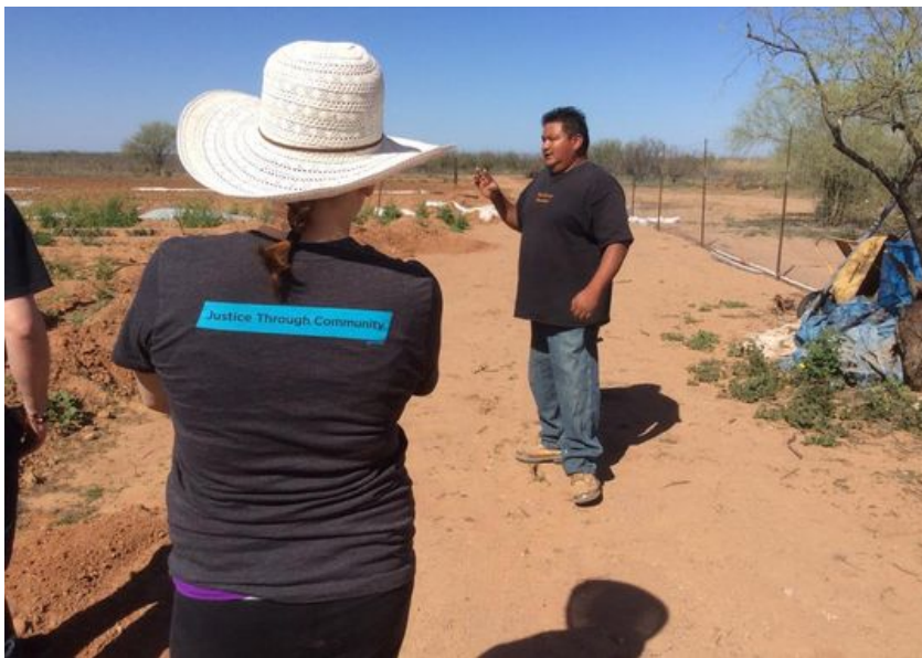
Tribal land in Nogales, Sonora.