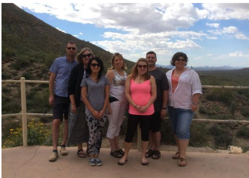
The social work students who participated in the 2015 spring break Mexican border trip.

Now, St. Scholastica's B.A. in social work has offered a partnership with Mesa Community College to make that possible.