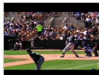
The Cactus League