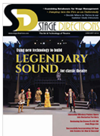
January 2016 Digital