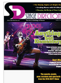
April 2016 Digital