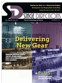
December 2015 Digital