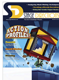
March 2016 Digital