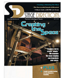
May 2016 Digital

Browse the online archives >>>222222222222