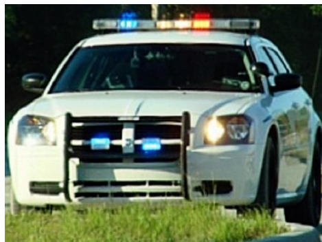
Mesa - New rule allows many Arizona residents to get car insurance at half-price.