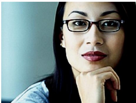
Monitor your credit. Manage your future. Equifax Complete™ Premier.