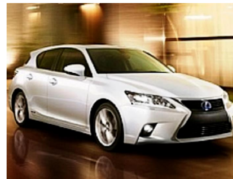
The 40 MPG Cars of 2014