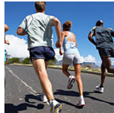
New Research: Big Benefits From Running 5 Miles A Week