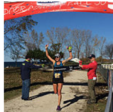
National 50-Mile Champ Was Recreational Runner 4 Years Ago