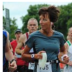
Don't Be a D-Bag! My 10 Commandments of Running RunHaven