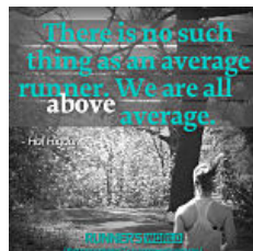
No Such Thing As An Average Runner