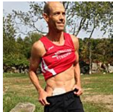
National 50+ Marathon Champion Runs with Ileostomy Bag