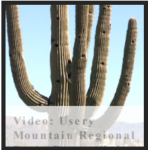
Video: Usery Mountain Regional