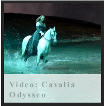
Video: Cavalia Odysseo