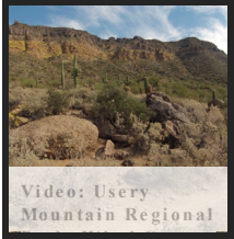
Video: Usery Mountain Regional