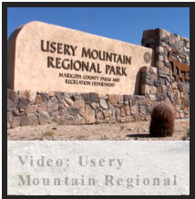
Video: Usery Mountain Regional