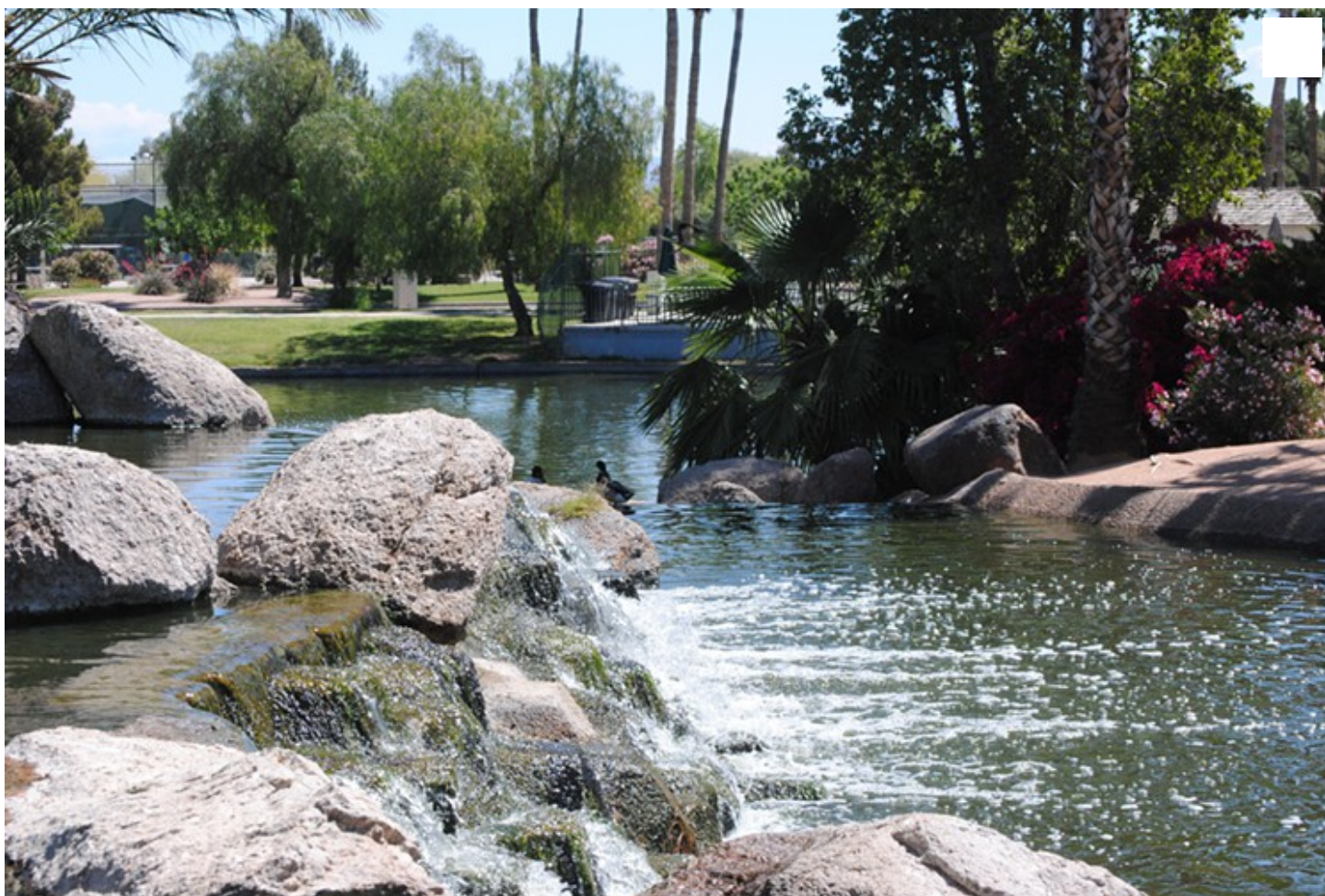
Freestone Park in Gilbert.