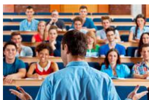
U.S. News Community College Directory