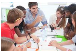
10 Reasons to Attend a Community College