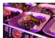
The 24th Annual Taste of the NFL at WestWorld of Scottsdale