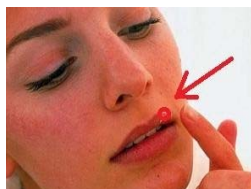
Is It Possible To Get Rid Of Herpes For Good?

For the original version on PRWeb visit: http://www.prweb.com/releases/2016/01/prweb13158817.htm