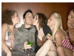
How To Pick Up Any Woman: This May Shock You!