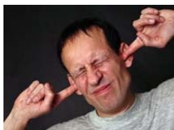
Strange Trick Reverses Hearing Loss In Just 120 Seconds?!