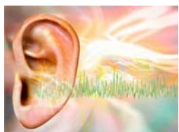
Tinnitus Solution Angers Doctors