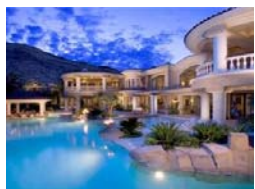
How People Like You Are Clearing Their Debt