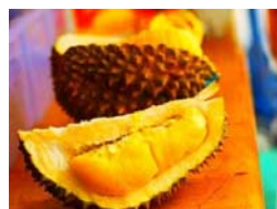
1 Weird Food That Eats Your Diabetes