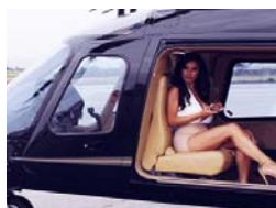
Watch How People Like You Are Making $6300 Every Week!