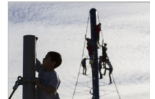
Photos: Cubs Park Grand Opening