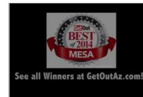
Best of Mesa 2014: Teachers