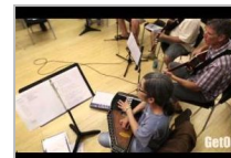
Local Guitar Group Meets in Downtown