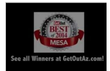
Best of Mesa 2014: Teachers