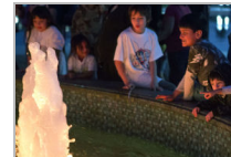
Chicago Cubs open new Spring Training