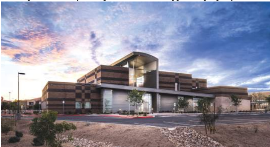
Community at Queen Creek, 21740 S. Ellsworth Road in Queen Creek, is operated by Rio Salado College, a member of Maricopa Community Colleges.