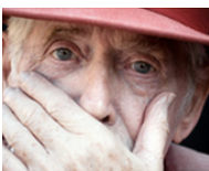
Billionaire Tells Americans to Prepare For "Financial Ruin" Moneynews