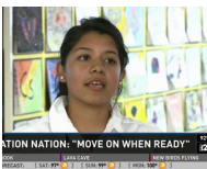
Some Arizona students set to get their diploma at 15