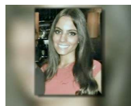
NY college student killed in hostage standoff