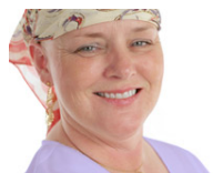
These 5 Things Start Cancer in Your Body. Watch Video. New smax