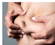
The Secret to Getting Thin No Matter What You Eat Knew orthy