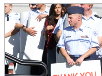
Photos: Veterans Day Celebration