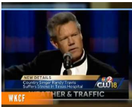
Randy Travis in Critical Condition After Stroke