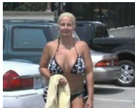
Bikini clad woman kicked out of water park