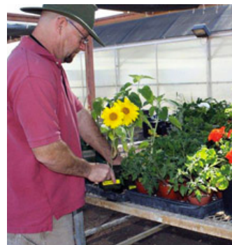
Mesa Community Horticulture

The Urban Horticulture program at MCC prepares students for a variety of careers as technicians, supervisors, managers, or owners in wholesale or retail nurseries, landscape design and construction operations, or landscape