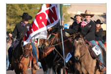
Photos: Gilbert Days Parade 2013