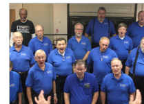
Video: The Lamplighter Chorus