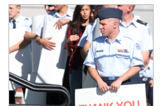
Photos: Veterans Day Celebration