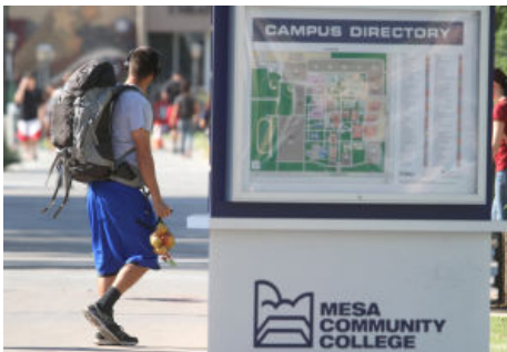
[Tim Hacker/ Tribune]