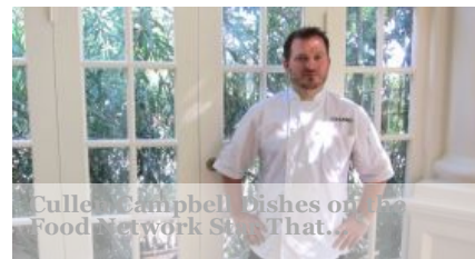
Darren Campbell wishes on Food Network Star That...