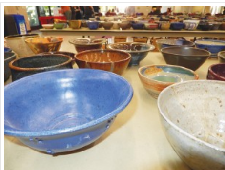
Bowls lined tables at the charity event at Mesa Community College