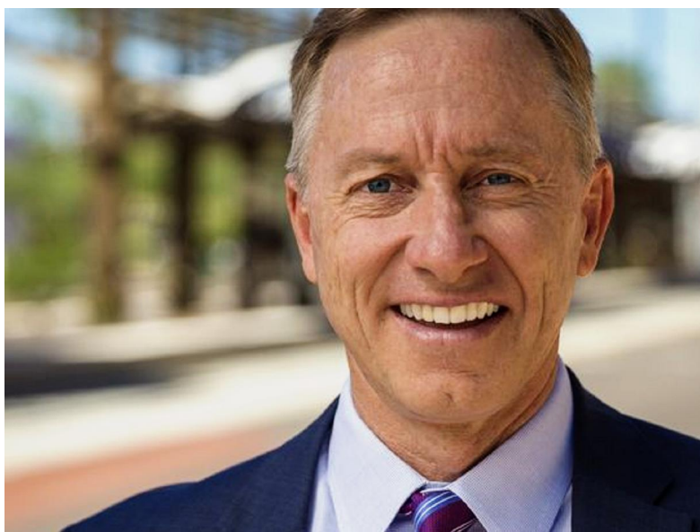
Mesa Mayor John Giles.

Education is one of our city's core values. Excellent schools are one of the main reasons many of us choose to live here. But, unfortunately, school readiness and educational attainment levels in Mesa are trending downward. We are at risk of losing one of the qualities that defines us.