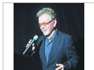
Songwriter Paul Williams: Principals