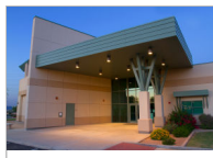
Budget expected to lead to funding cuts