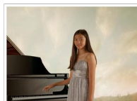
Hamilton student makes her mark in