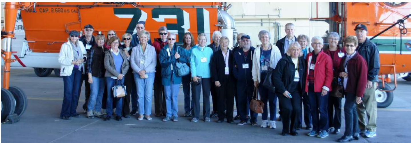
GATEWAY TOUR – JANUARY 12