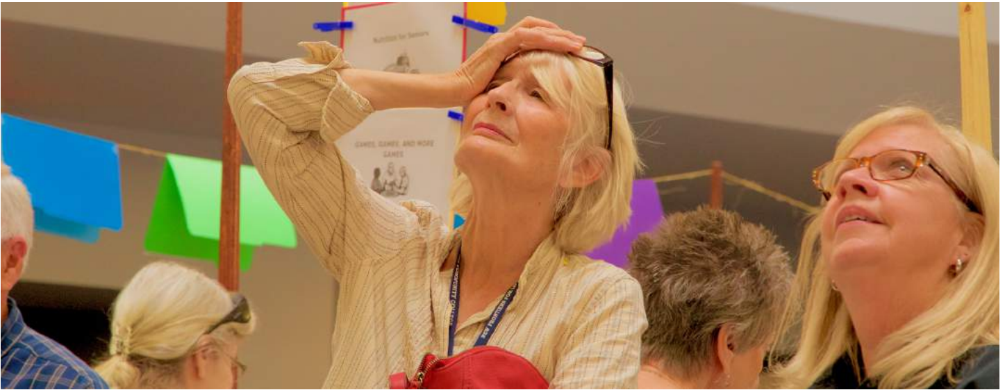
SO MANY CLASSES!