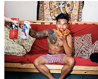
The Founder of MeUndies Couldn't Find Underwear He MeUndies | Medium