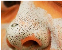
This Simple Skin Fix May Surprise You Gundry MD