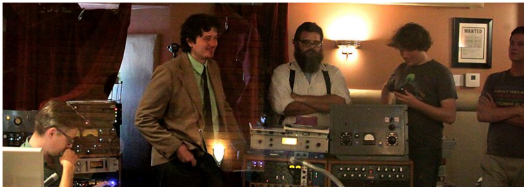
The Hill in Mind