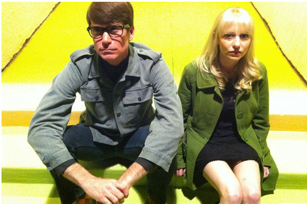
The Christian Family