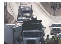
Photos: U.S. 60 Fatal Crash