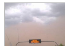
Video: Dust Wall Enters the East Valley