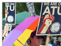
Photos: Bus drivers on strike in East