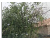
Photos: Monsoon July 15