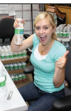
Student employees prepared 3,000 customized water bottles for the campaign.

people. The open rate for the messages is 14%, indicating a high level interest when compared to traditional direct mail rates. In addition, less than 1% of all people have opted to be removed from the list.