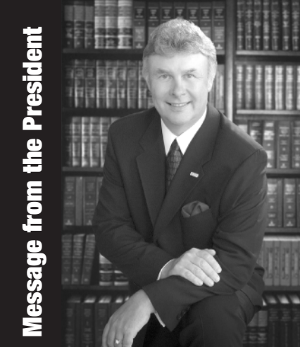
Message from the President

On June 8, the Maricopa Community Colleges Governing Board formally approved, by a 5-0 vote, placing a $951 million bond request on the November 2, 2004 ballot.