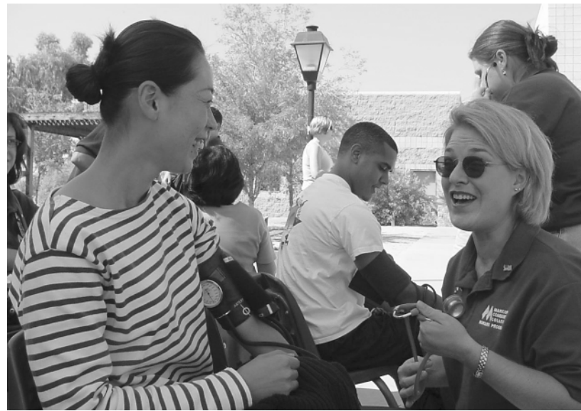
MCC Nursing students promote community health by providing blood pressure screenings on campus, educating both employees and students about the risks and symptoms of high blood pressure.