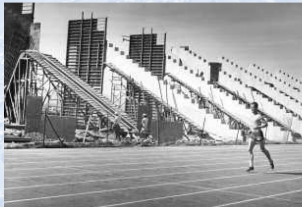
MCC's football stadium was dedicated in 1969.