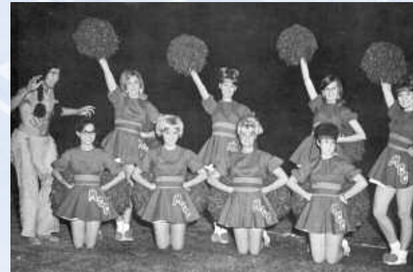
MCC's first mascot was the Hokam (pictured left)