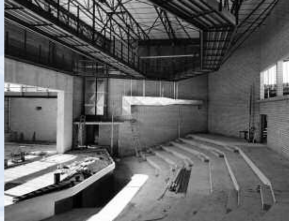
Construction of the Theatre Outback began in 1976