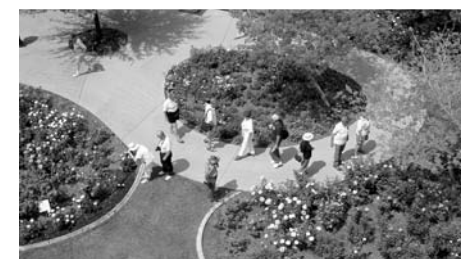
The Rose Garden at MCC, Southern & Dobson Campus