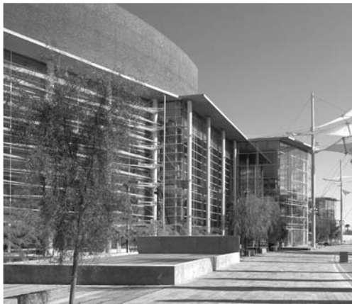
View of the new Mesa Arts Center in Mesa, Arizona

The Alumni Relations Office, in conjunction with the Alumni Board, proudly announces a new series of local field trips. We hope you will be able to join us for an opportunity to connect with other alums while learning something new!