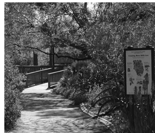
Boyce Thompson Arboretum

For more information about the Desert Botanical Gardens please visit www.dbg.org .