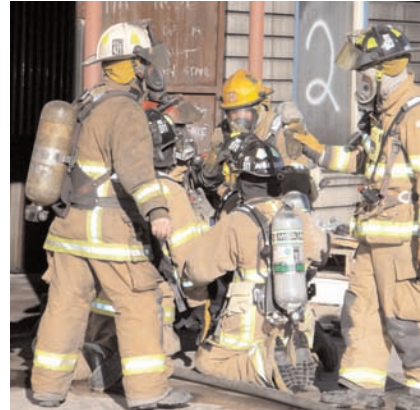
MCC's Gila River Fire Department recruits in training.