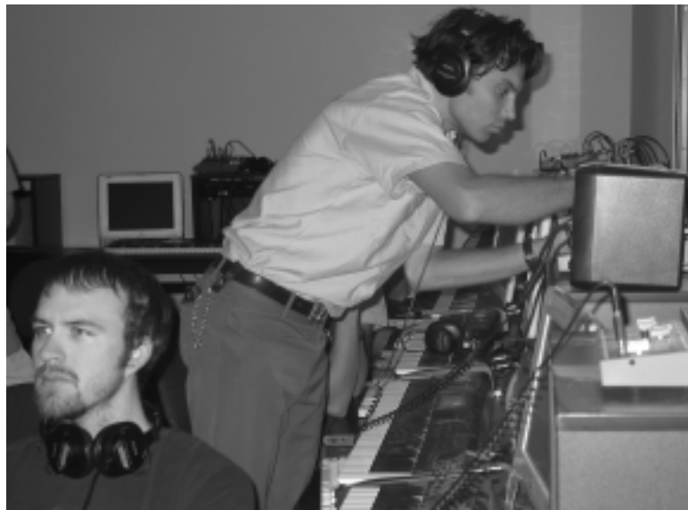
Music students attend a lecture in Studio 28. Studio 28 (formerly the KJZZ radio station) was recently remodeled.

This semester the Music Dept. has moved in and is offering classes in audio production technology. They needed a larger area for their computerized sound programs and a live mixing studio, while the Theatre Dept. needed a drafting studio for theatrical CAD and space for a lecture class, among other things. Studio 28 features a live sound room, small control room, digital audio workstation, and a live recording studio.