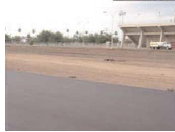
Removal of the islands in Lot C created approximately 100 new parking spaces.